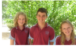
FROM OUR STUDENT LEADERS