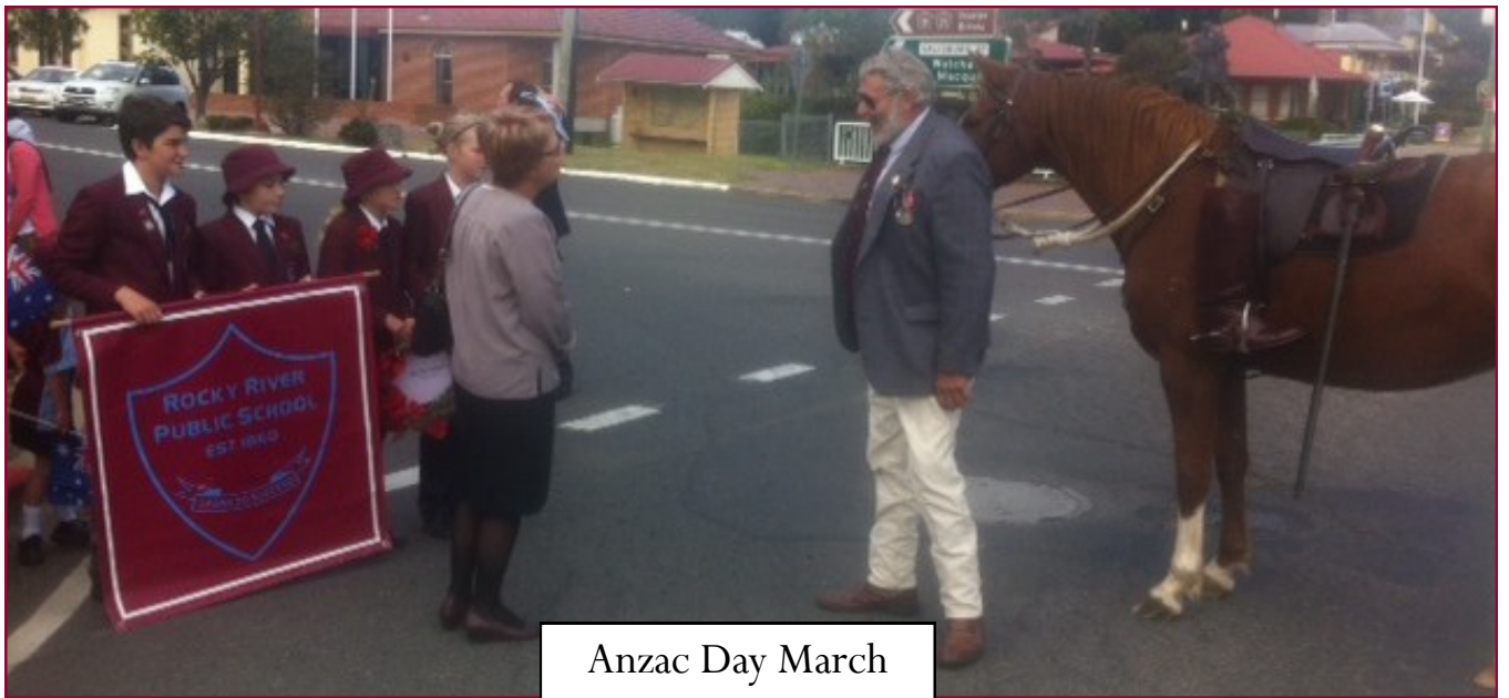
Anzac Day March