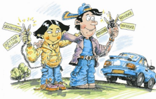
Five Keys to Success and Happiness